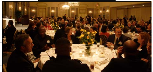
Cherokee Town Club Main Banquet Room