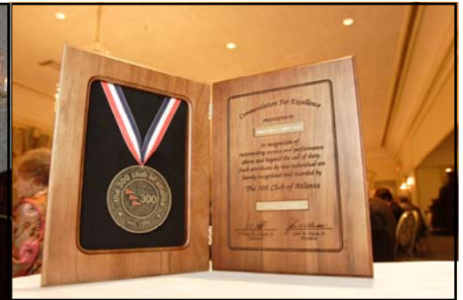
2005 Honoree Plaque